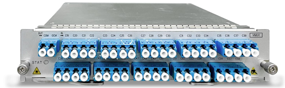
Figure 1: VMUX Board

The user configures manually it and it automatically equalizes and balances the power of the added and bypassed wavelengths when it can be combined with OCM card.